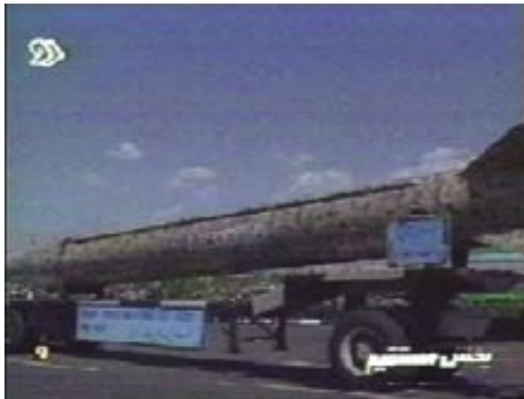
Figure 4. Shahab 3 in Tehran with the banner "Israel should be wiped off the map," September 1999. Similar banners have since been displayed on Shahab 3 launchers in every annual Martyr's Week parade.

With this kind of power projection capability, namely, with missiles that are both capable of reaching every corner of the Middle East and survivable against preemption, Iran is already the major missile power of the region, at least in theory. The effectiveness of its missiles, however, seems to qualify this capability to some extent.