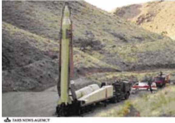
Figure 2. Shahab 3-ER being prepared for a flight test, August 2004

shape (figure 2). Shortly after this test, Iranian sources disclosed that their missiles could now achieve the range of 2000 km. No specific name was given to this new version, which for the purpose of this paper will be called Shahab 3-ER. Initially some slight embarrassment could be discerned in Iranian statements over the extended range, which seemed to violate an unwritten understanding that Europe should not be targeted (the 2000 km range covers most of Eastern Europe). Recently, however, Iranian officials were citing this range openly when extolling Iran's power of resistance against prospective US military action.