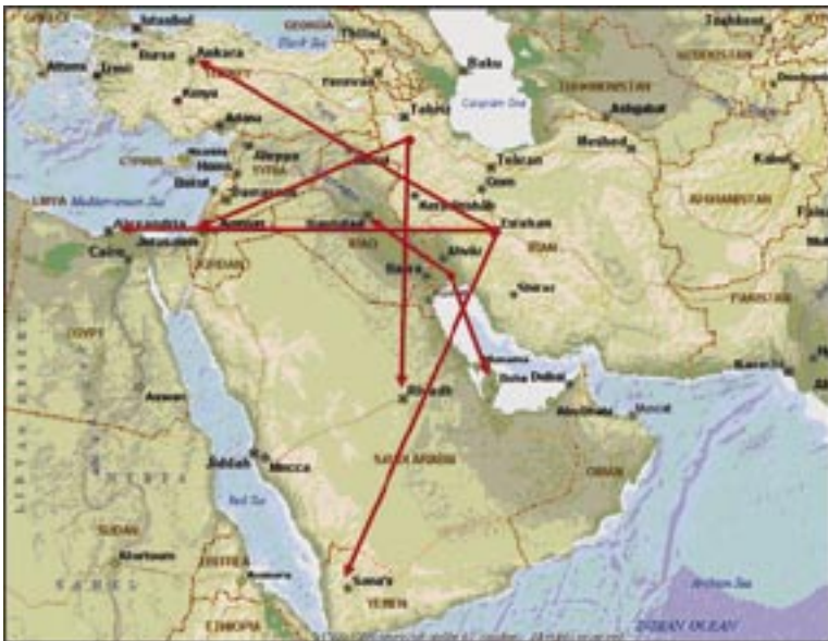
Figure 3. Iran's Shahab missile power projection from hardened fixed sites (site locations are notional)

the southern narrows of the Red Sea are within range of the Shahab family of missiles. Even more significant, Iranian ballistic missiles can now cover the entire area of the Middle East from fixed sites deep within Iran's borders. The importance of this capability cannot be overemphasized. All the Shahab variants are designed to be transported by and fired from land mobile launchers. The survivability of land mobile missiles is based on their mobility, which permits them to travel from their launch sites into hiding places shortly after firing off their missiles. This is how Saddam's missileers evaded the US air assets sent to destroy their launchers during the 1991 Gulf War. Yet land mobility carries its own risks to survivability: if provided with timely intelligence, the attacker can theoretically intercept and destroy land mobile launchers when they are on the move for operational or logistics purposes. Hence, suitably hardened fixed sites were preferred by both superpowers as the chief (and in the case of the US, the exclusive) basing mode of the core of their ground based ICBMs. There are indications that the Iranians are now following suit.