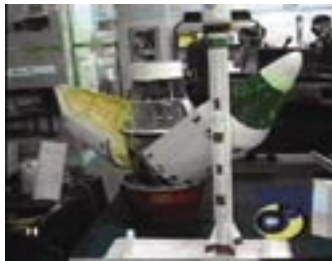
Figure 7. Models of an Iranian indigenous space launch vehicle and a reconnaissance satellite, March 1998

Iran announced its intention of becoming a spacefaring nation almost as soon as it unveiled the Shahab 3 missile. In a televised visit of Iran's supreme leader Ali Khamenei to an Iranian arms exposition in 1998, the cameras recorded a scale model of an SLV (Space Launch Vehicle) with a bulbous nose fairing. Nearby stood a model of a satellite of uncertain provenance (figure 7). The multi-stage SLV had the initials IRIS painted on its sides and was clearly related to the Shahab missile. Analyzing the images, Israeli experts concluded that the IRIS was most probably a "theme SLV" and not a practical design, since its lifting capabilities were calculated to be miniscule.