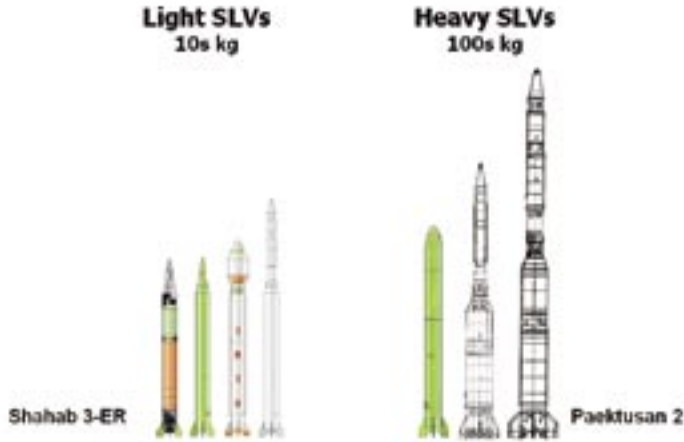
Figure 9. Notional modeling of Iran's prospective SLV families (credit for light SLV modeling: Mark Wade, Encyclopedia Astronautica)

The heavier, workhorse-type of SLV is more demanding. Iran could buy the alleged North Korean Paektusan (Taepo Dong) 2 heavier SLV, if it really exists. Alternatively, Iran could emulate Saddam Hussein's rocket engineers by clustering several Shahab 3 rockets into a heavy first stage, use a single Shahab 3 as a second stage, and top it with a small solid propellant motor as a third stage. 5 It is, however, more likely that the workhorse SLV will be based on Iran's emerging solid propellant capability. The hint in this direction came from Shamkhani's 2000 information on an SLV with a solid propellant second stage. An all-solid propellant, three-stage SLV with the diameter of the Shahab 3 would yield a very effective launch vehicle. It would have no problem in orbiting several hundred kg spy satellites from Qom or an equivalent spaceport within Iran, with none of its spent stages endangering inhabited areas. A two-stage version of this SLV could make a very capable long range ballistic missile that could reach all the way from Iran to the Atlantic Ocean. A three-stage ballistic missile based on this SLV could put a warhead on any point in the US.