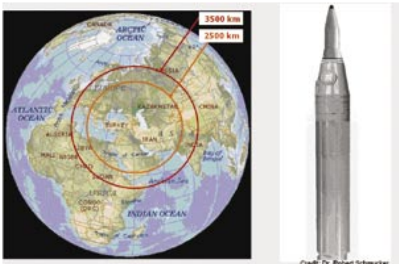
Figure 6. The BM25 (land mobile version of the Soviet SSN6 SLBM) and its range from eastern Iran according to Israeli and German sources (BM25 modeling courtesy of Dr. Robert Schmucker)

In January 2006, a German newspaper revealed the transfer of a new type of missile from North Korea to Iran, dubbed BM25 and having a range of 3500 km. The transfer of the new missiles to Iran was subsequently confirmed by Israel's chief of military intelligence, General Amos Yadlin, although the attributed range in his statement was 2500 km. The missile is reported to be a land based, extended range version of the venerable Soviet era SSN6 SLBM (figure 6). According to the reports, eighteen of those missiles with their launchers were purchased from North Korea. The Iranian government denied the