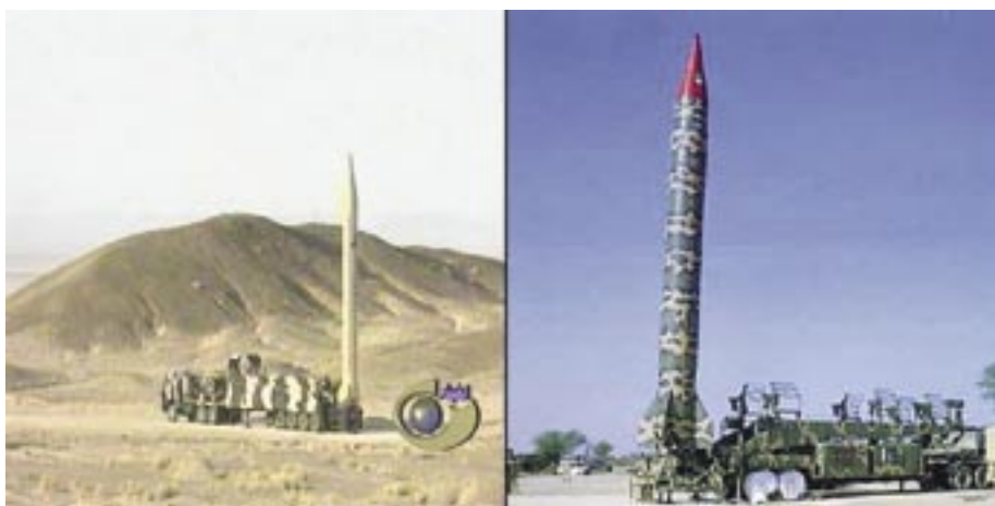
Figure 1. North Korean exports; left: Iran's Shahab 3; right: Pakistan's Ghauri

km – sufficient to hit Tel Aviv and Riyadh, from well within Iranian territory. While the deployment of the Shahab 1 and 2 could be seen in terms of the threat from Saddam's Iraq, the range of the forthcoming missile reflected the shift in Iran's threat perception against the West. It was now the US forces in the region and their allies who were seen as the main threat. The new missile was clearly aimed to dissuade Saudi Arabia from hosting US forces, and to punish Israel if and when a US-led attack was launched against Iran. Later in the decade, the new missile, which surfaced in a July 1998 flight test trumpeted by Iran's state-owned television, was named the Shahab 3.