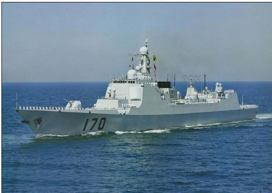
Figure 6. Luyang II (Type 052C) Class Destroyer