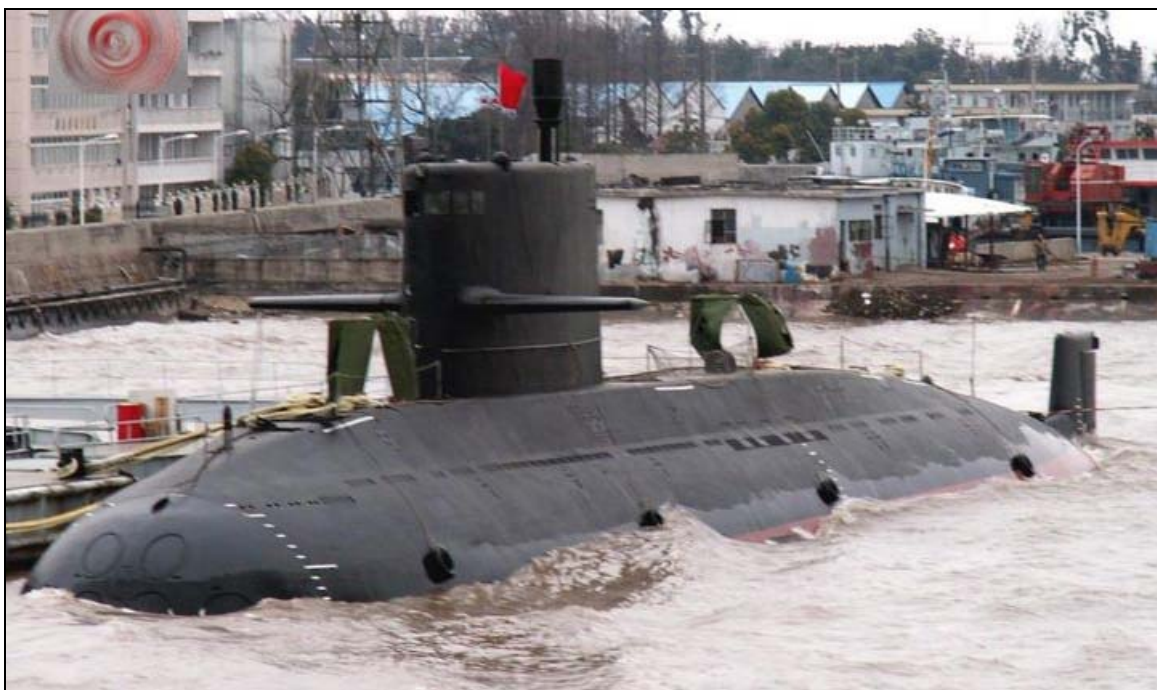
Figure 2. Yuan (Type 041) Class Attack Submarine