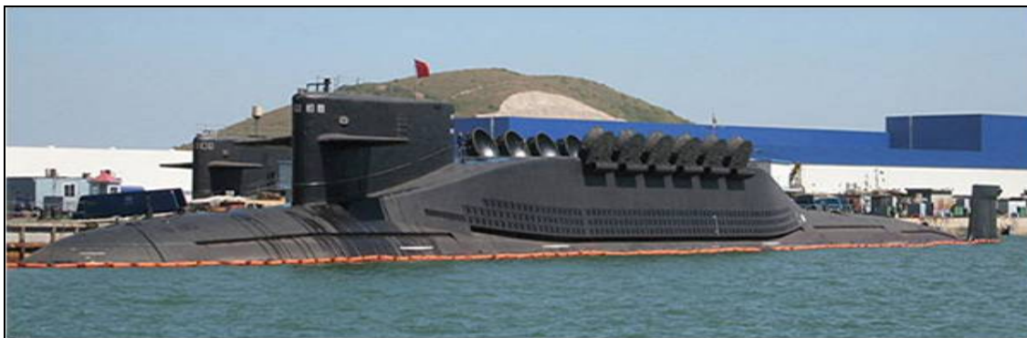
Figure 1. Jin (Type 094) Class Ballistic Missile Submarine