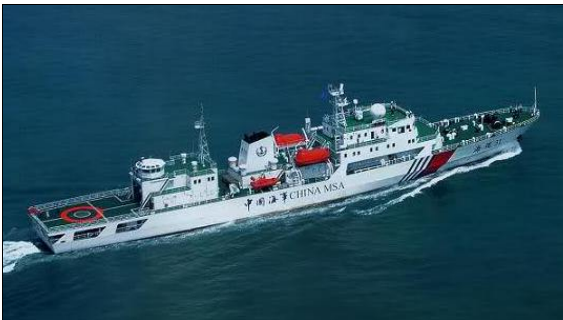
Figure 10. Haixun 01 Maritime Patrol Ship