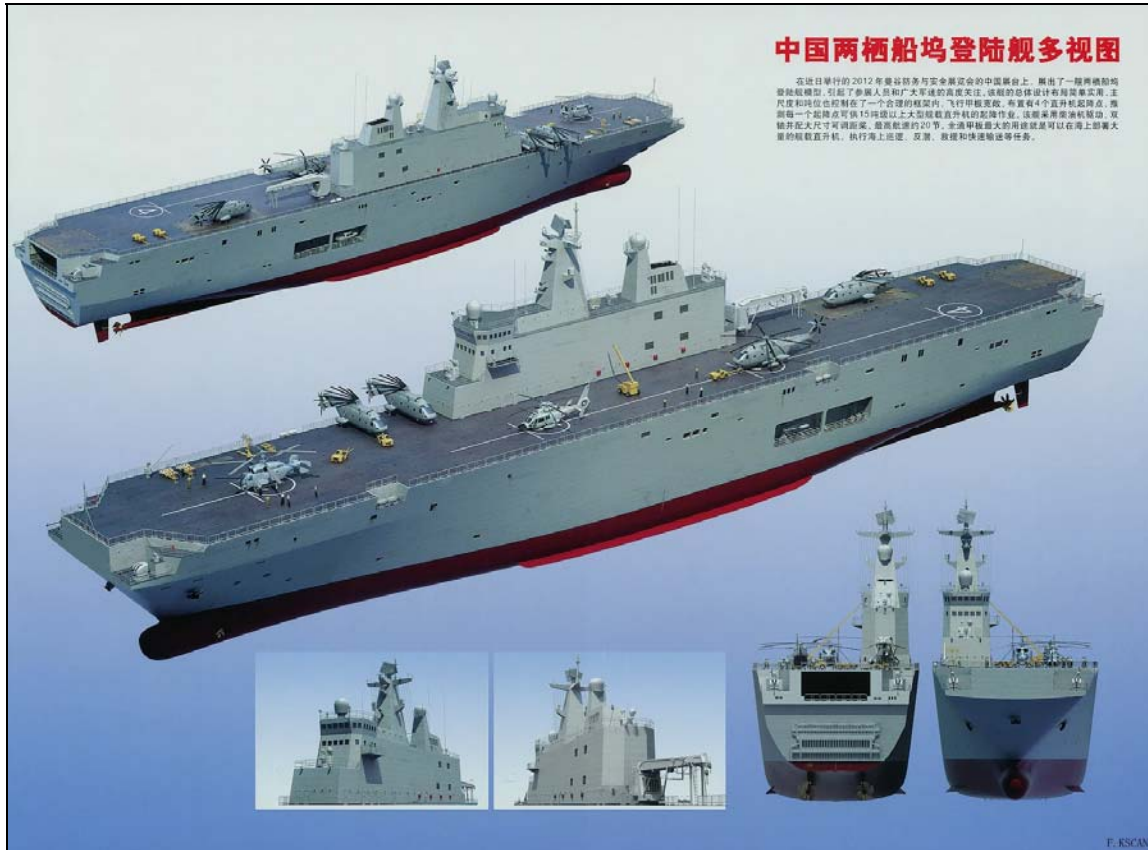
Figure 12. Type 081 LHD (Unconfirmed Conceptual Rendering of a Possible Design)